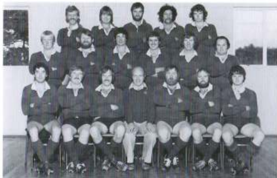
1981 Third Grade, Section One - Winners National Mutual Sportsmanship Award