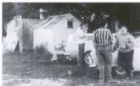
The temporary changing sheds.

In November 1968 the changing shed was destroyed by fire leaving the club without any facilities. As a short term solution, two small sheds were moved to the ground. The following year the Rugby Club and the West Taieri Scout Group agreed to combine in an effort to have a hall built that could be used by both groups. Plans were drawn up and the cost of the building was estimated to be $10,000. Further scrutiny of the plans however, revealed that there was no provision for a changing room for the rugby players. The plans were altered