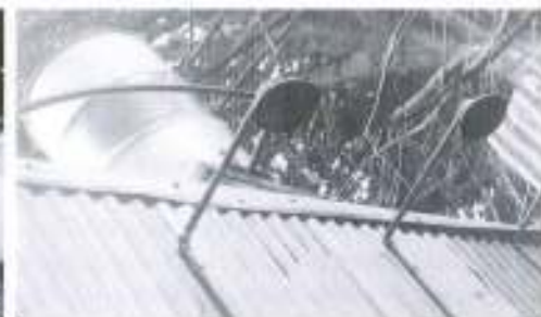
The open-air showers!