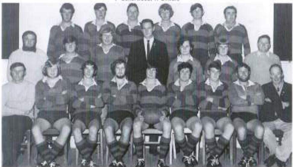
1972 Third Grade