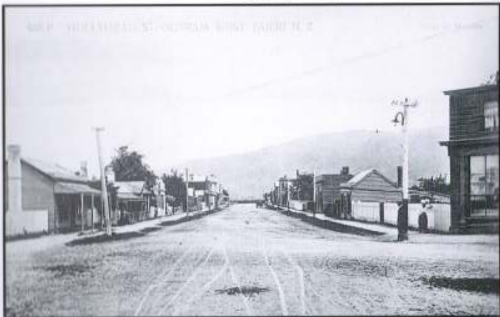
Outram circa 1900