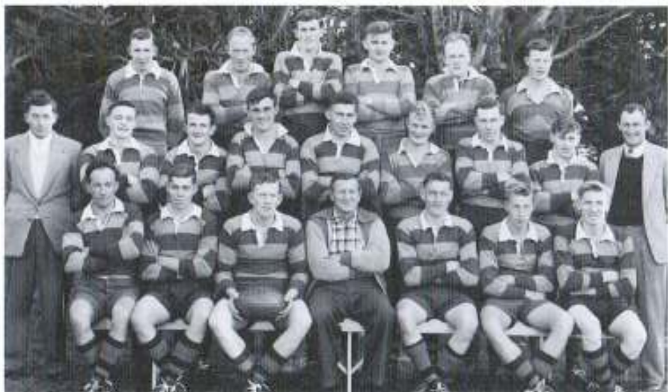
1959 Joint Winners 3rd Grade, Section 2.