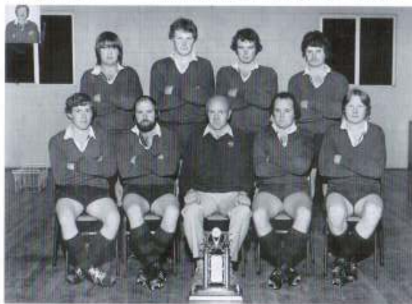
1983 Seven A Side Team - Winners of Metropolitan Seven A Side